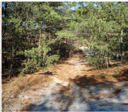
The Hills at Southampton MUPDD East Quogue