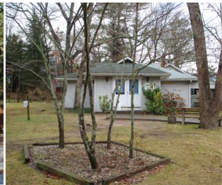
Kent Animal Shelter Calverton