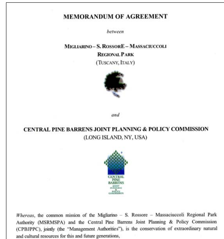
Right: Cover of the 2004 MOA.