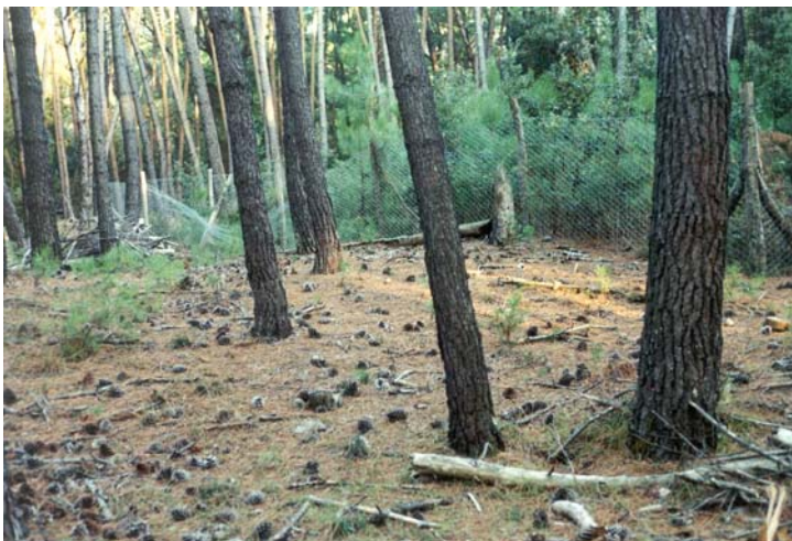
Left: a deer and boar enclosure study site in MSRM Park.