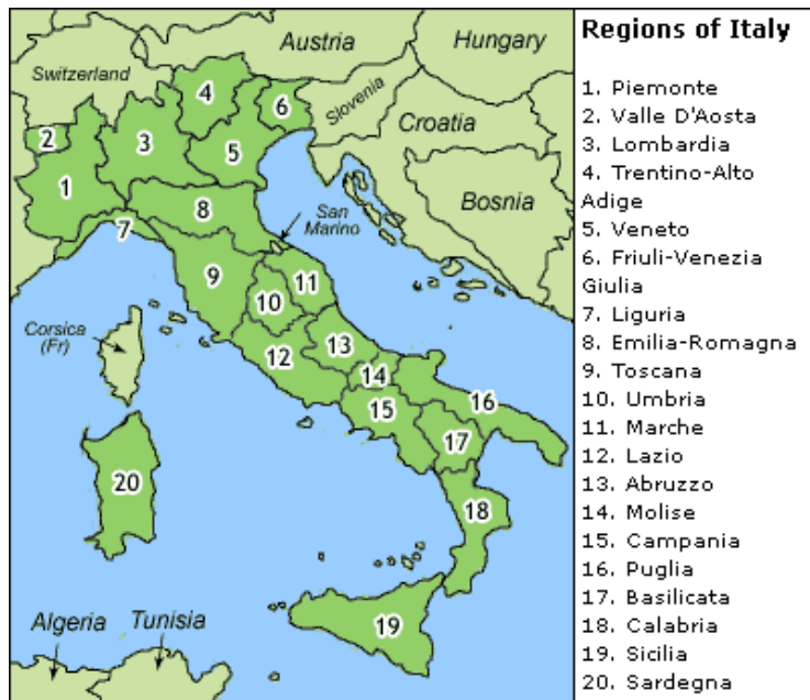
Above: © 2003 Map of Italy; http://www.big-italy-map.co.uk/

Literally a greenbelt between the City of Pisa and its 100,000 citizens and the Ligurian Sea (part of the Mediterranean), MSRMR Regional Park’s approximately 24,000 hectares includes a former presidential estate, numerous modern and ancient historical sites, wide swaths of agricultural lands, fresh and salt water bodies, residential and commercial areas, and many of the same land use juxtapositions found in the Central Pine Barrens of New York State.