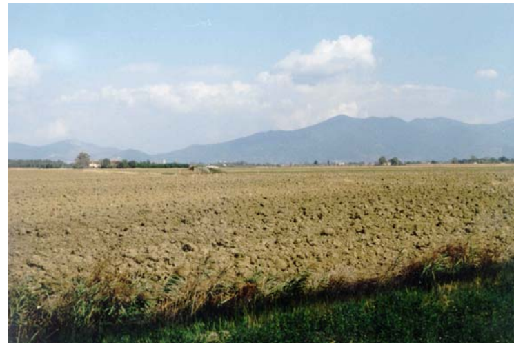
Private farmland in the Coltano Estate area.