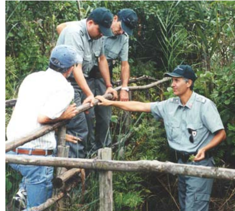
Left: MSRM Rangers during a tour of Lake Massaciuccoli. Natural resource protection is their focus.