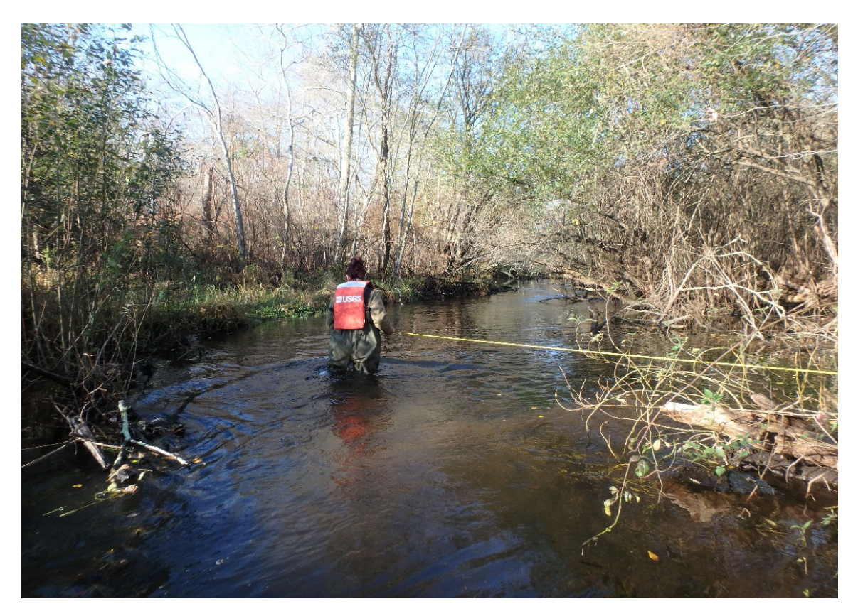
Figure 2. USGS hydrologic technician collecting water quality data at Lower Lake (01304998) at the Carmans River.

Quality assurance and quality control data collected as part of the surface water-quality project for the CPB included one equipment blank, one field blank, one environmental sample replicate, and one pesticide field spike.