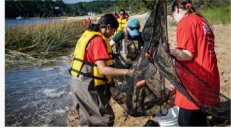
Smithtown East High School students look for samples of fish, seaweed and other marine life at Short Beach-on-Quil, B while exploring how the Nissequogue River and estuary fit into the ecosystem.

Just as important as data are deer and other wildlife, teachers said.