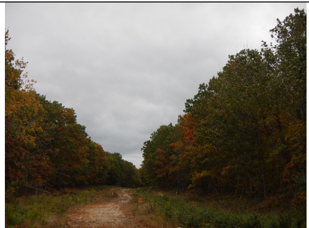
RD Industrial, Yaphank (CGA)