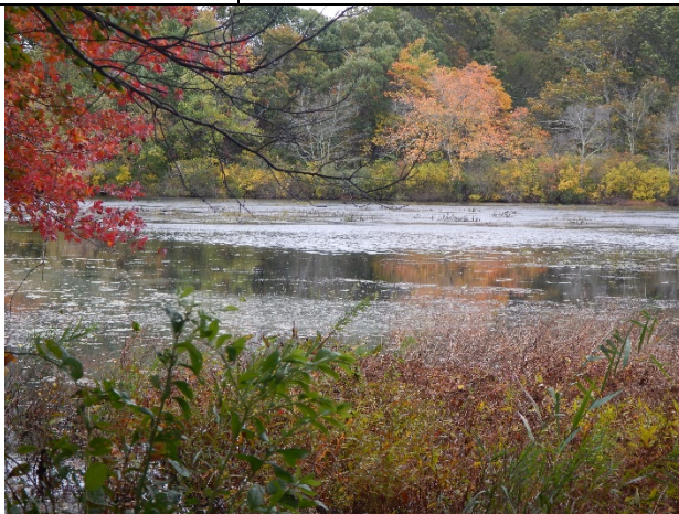
Peconic River (Core)