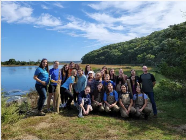
The "Day in the Life" program is sponsored by Brookhaven National Laboratory, the Long Island Pine Barrens Commission and the New York State Department of Environmental Conservation.

Press release from the Sachem Central School District: