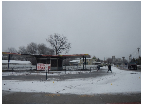
7 Eleven, Riverside