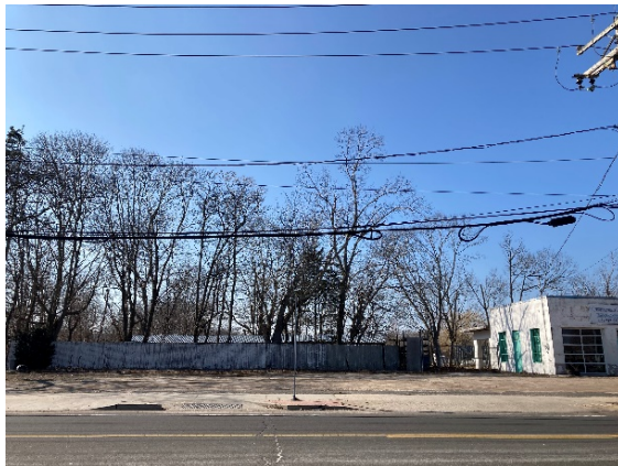
Peconic Paddler, Riverside