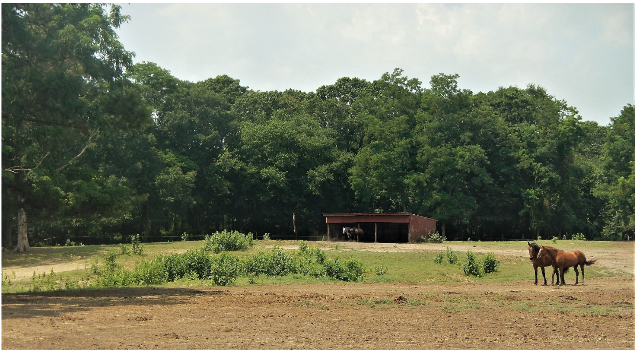
Equine Facility LLC (Hidden Pond Stables), Manorville, added to the program in 2021