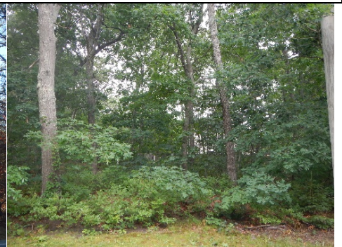
59 Ryerson/Darcy Avenues, Manorville