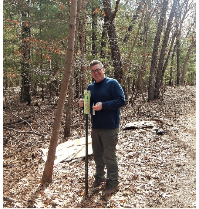
Medford Road, Ridge Area