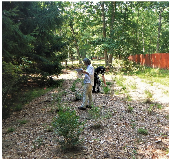
Peconic River Sportsman's Club