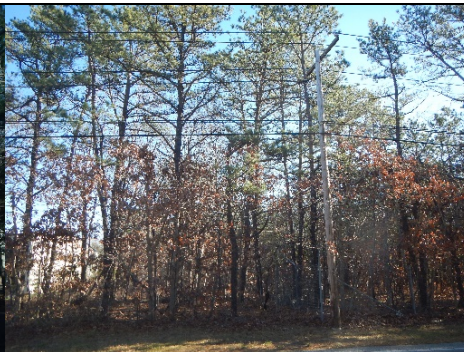
Toscano Site Plan, Speonk