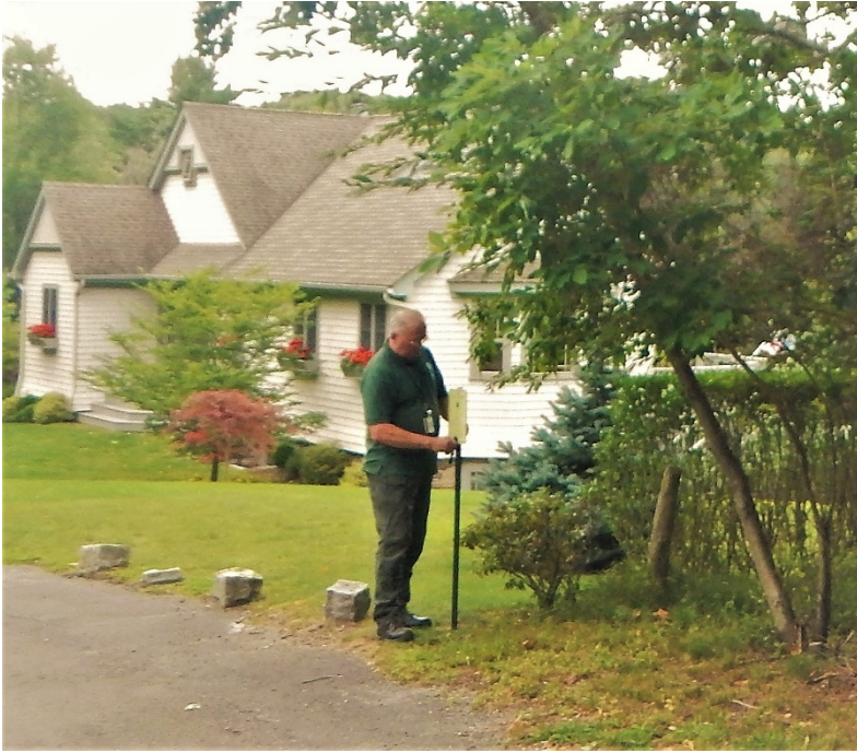
Gregory property by Wildwood Lake