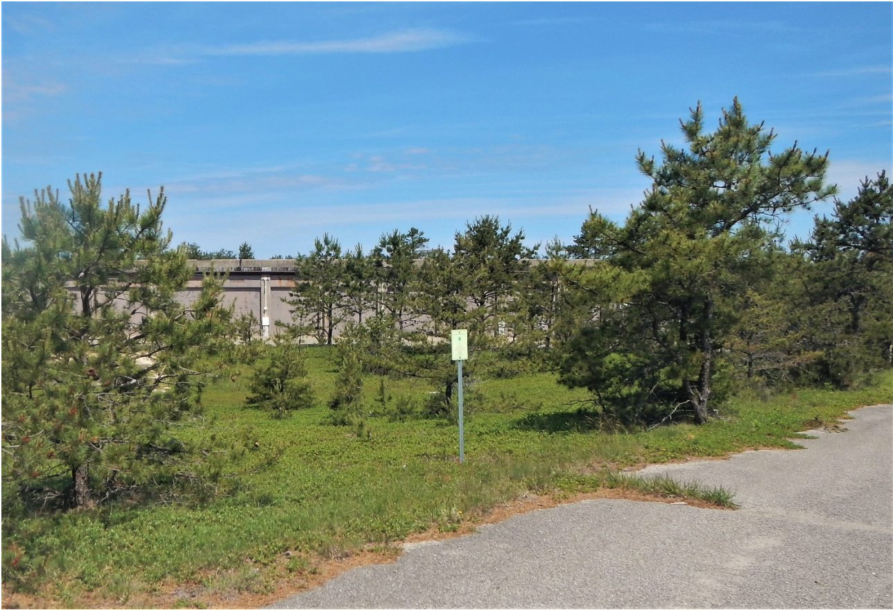
Tuccio Storage Facility