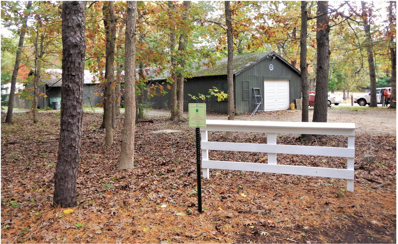
Nassau County Boy Scout Camp