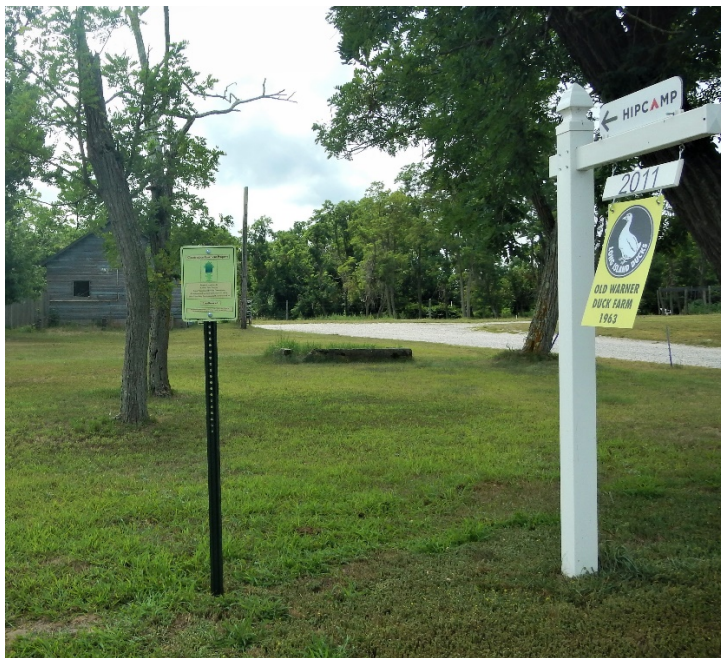
Former Warner Duck Farm