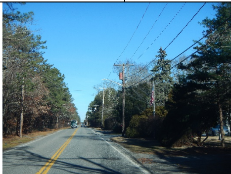
PSEG-LI Reconductoring, Speonk