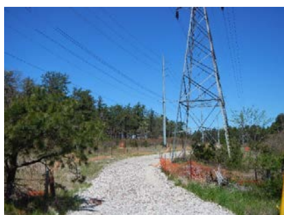
Riverhead Substation LIPA Right of Way (Core)