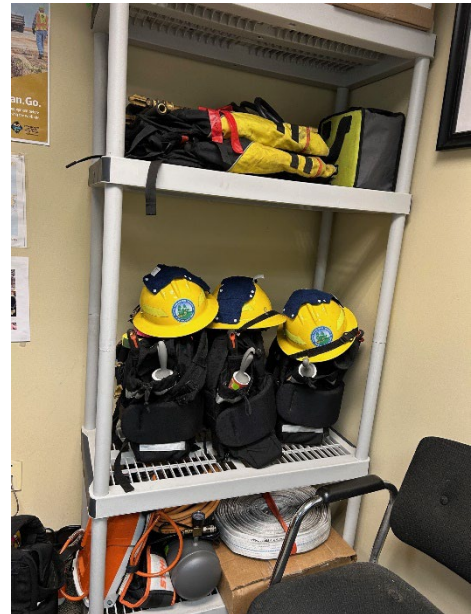
Figure 2: PPE and Line gear for the FFT2s is ready for the crewmembers who start in March.